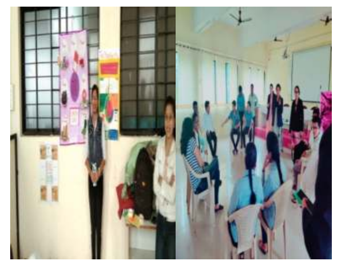
INNOVA PROGRAM WAS ORGANIZED BY BBA DEPARTMENT

Feedback system :- www.rjspmcollege.ac.in