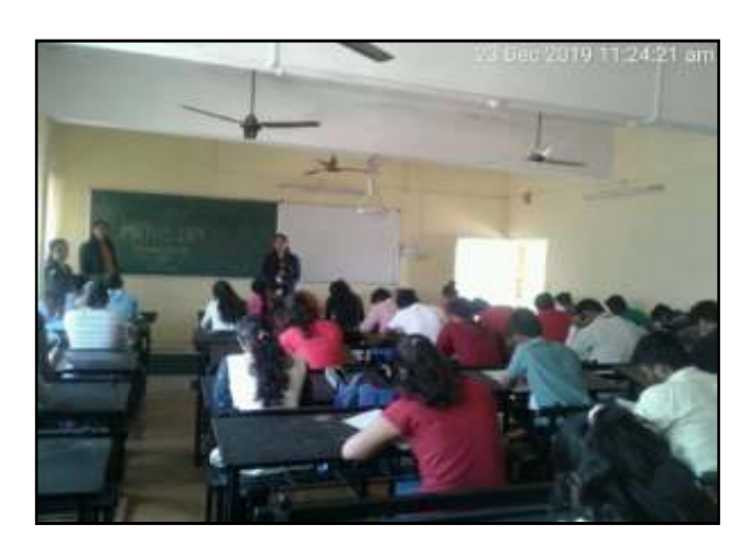
APTITUDE TEST AND QUIZ COMPETITION WAS ON THE OCCASION ON MATHEMATICS DAY