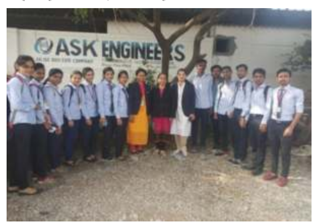
INDUSTRIAL VISIT TO ASK ENGG. BHOSARI