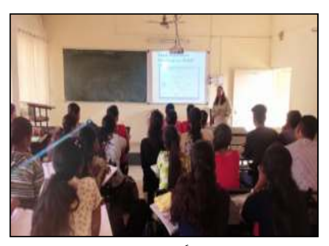
ADD-ON COURSE ON SOFTWARE TESTING (B.SC(CS) & M.SC(CS) DEPARTMENT)