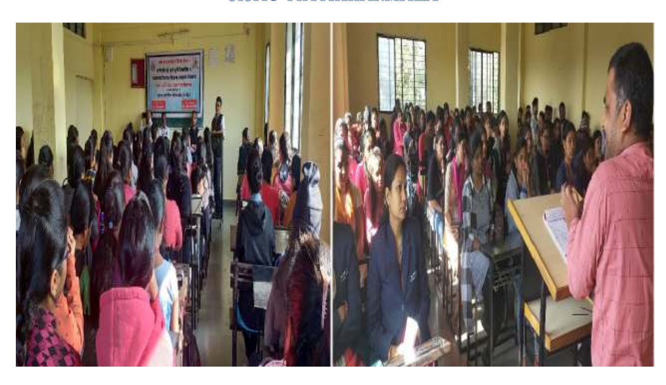
LIFE LONG LEARNING AND EXTENSION