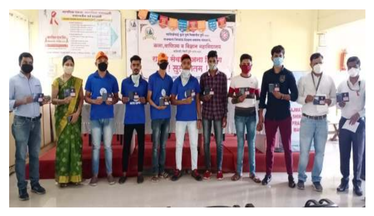
AIDS AWARENESS WEEK